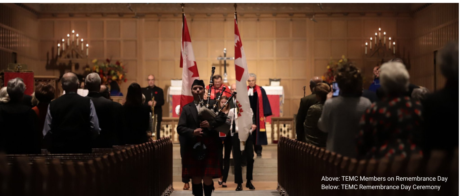
Above: TEMC Members on Remembrance Day Below: TEMC Remembrance Day Ceremony

In 1940, six churches of the Churches-on-the-Hill organization held the first of many meetings to determine how they could work together. During the war years, they held joint worship services monthly and an annual supper. By the end of the war, 451 young people from the TEMC congregation were in uniform and 27 had been killed in action. In keeping with a more somber wartime mood, military affairs did not play as prominent a part as had been the case in the First World War. Nevertheless, several military regiments deposited their colours in the Church. As in the First World War, members of the Community Service Club worked at the Church from 10 am - 4 pm every Wednesday and Thursday for the war effort. The Club began sending bundles to Britain in 1941 and continued throughout the war. In addition, women further contributed as clerks for the issuance of ration books and as volunteers for the Red Cross and several other organizations. Many members also took an active leadership role in community work for organizations such as the United Welfare Fund, The Big Brother Movement, the Victor Home for Girls, the Canadian Historical Association, and the Ontario Safety League.