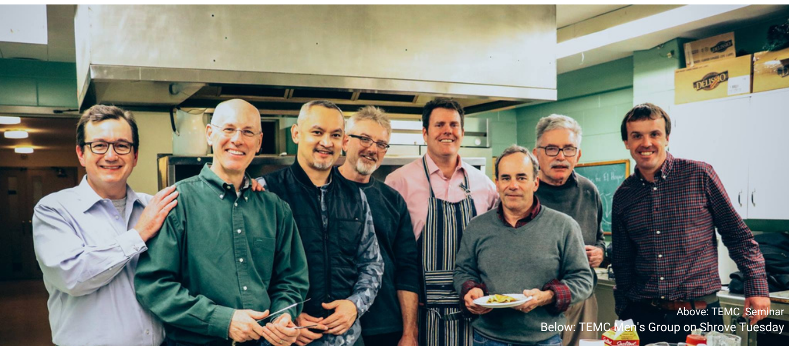
Above: TEMC Seminar Below: TEMC Men's Group on Shrove Tuesday