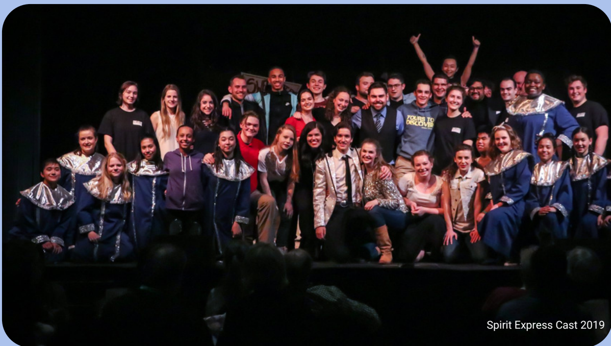
Spirit Express Cast 2019

We meet regularly throughout the year with our young people to intentionally explore what it means to live as a Christian both in the Church and in the world. We offer opportunities to participate in the life of the congregation, as they consider what it means to be an active member of The United Church of Canada. A weekend retreat has been part of the program in the past when possible.