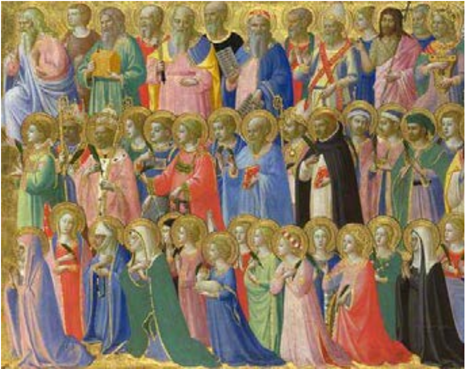
Image: Fra Angelico

All Saints Sunday, November 3, 2024 9:15 a.m. (pages 2-5) 11:00 a.m. (pages 6-9)