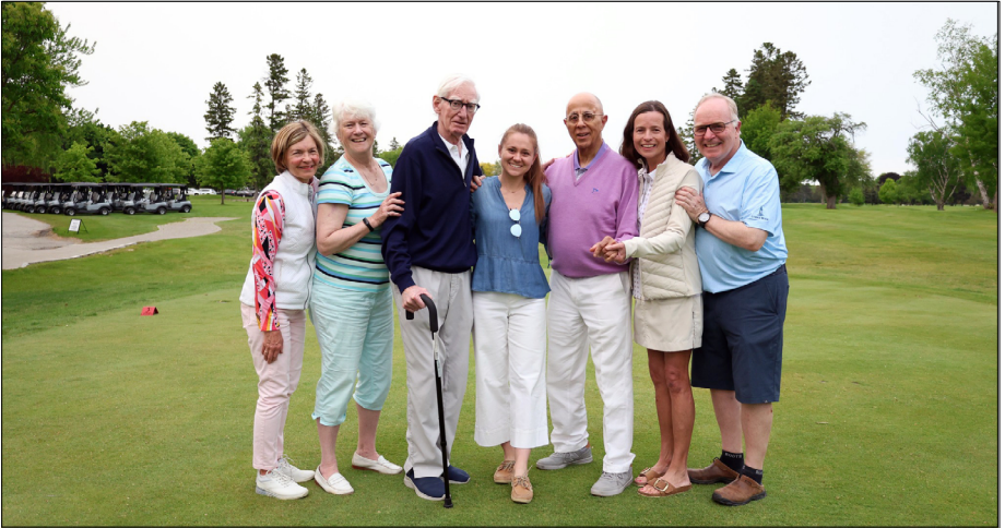
2025 Golf Committee