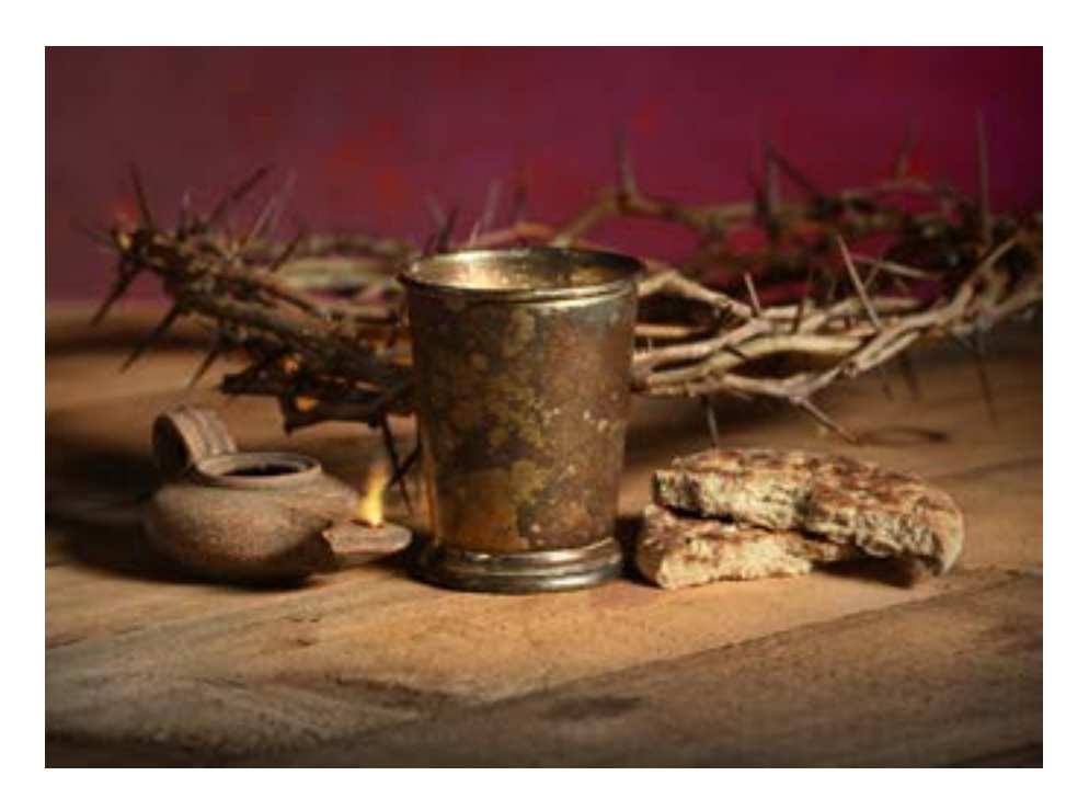
Lent III – Sunday, March 3, 2024 9:15 a.m. (pages 2-6) 11:00 a.m. (pages 7-10)