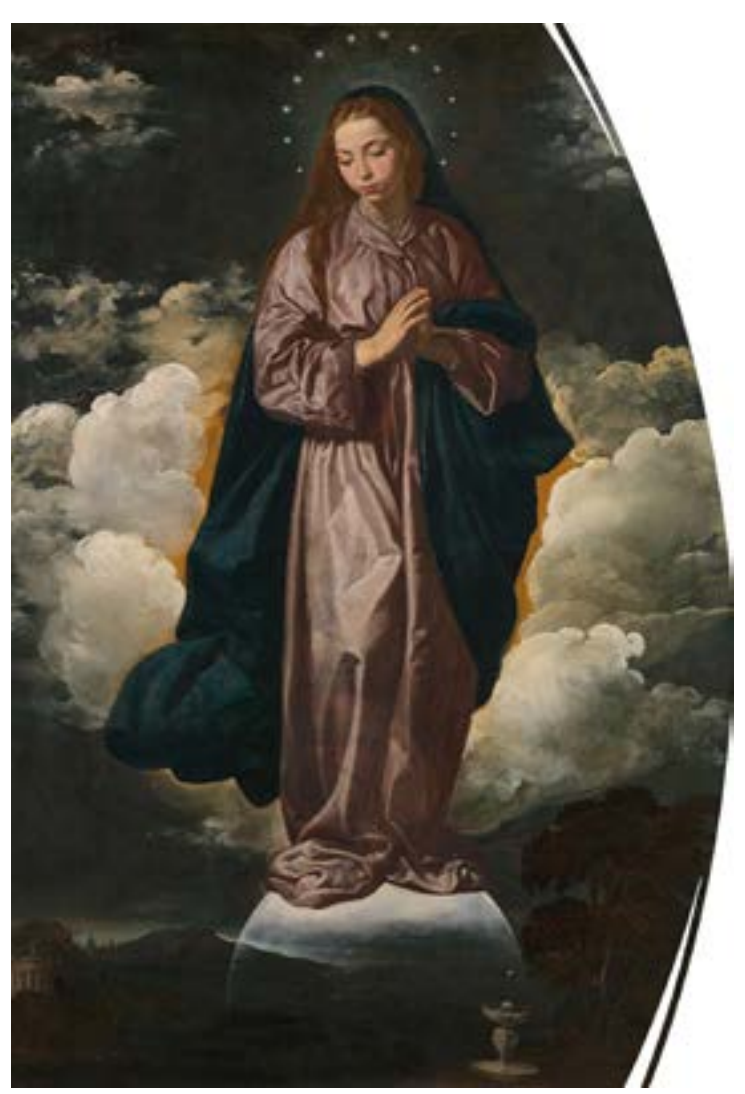
The Immaculate Conception by Diego Velazquez

Advent II – White Gift Sunday, December 8, 2024 9:15 a.m. (pages 2-6) 11:00 a.m. (pages 7-9)