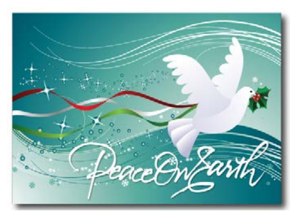
Sunday, December 29, 2024 – 11:00 a.m.