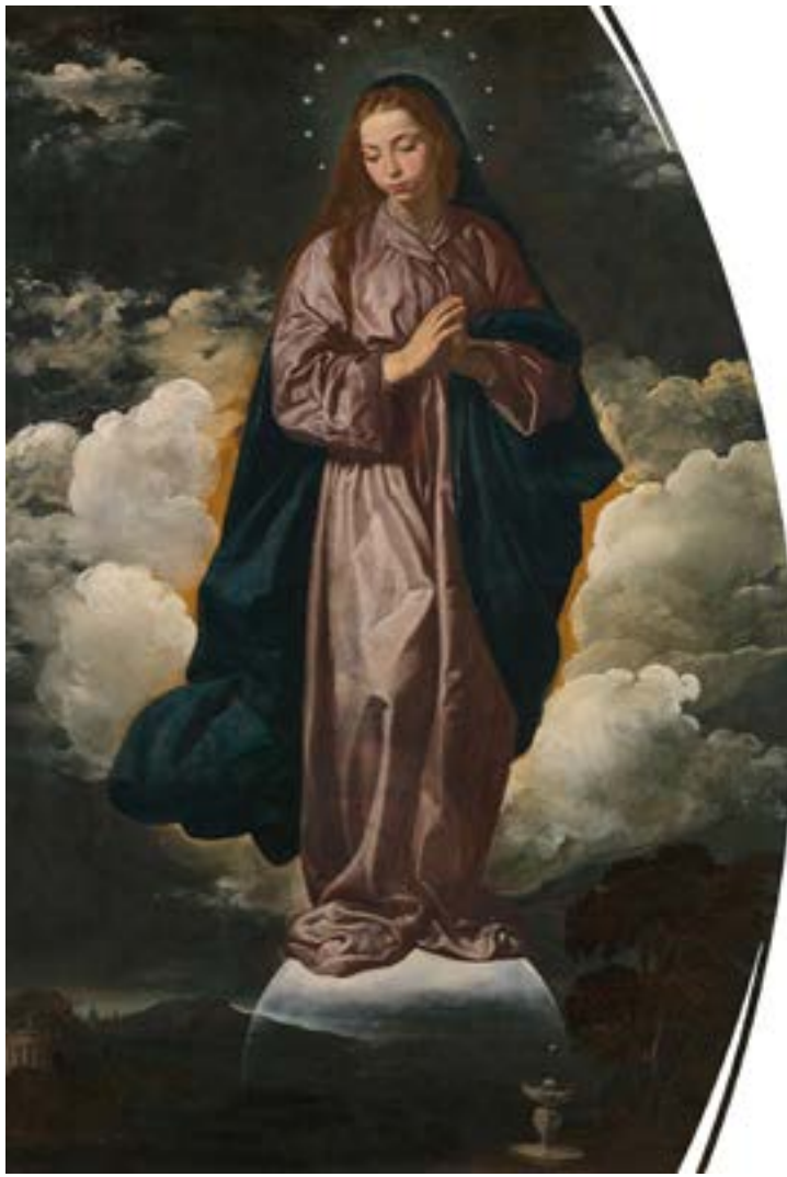
The Immaculate Conception by Diego Velazquez