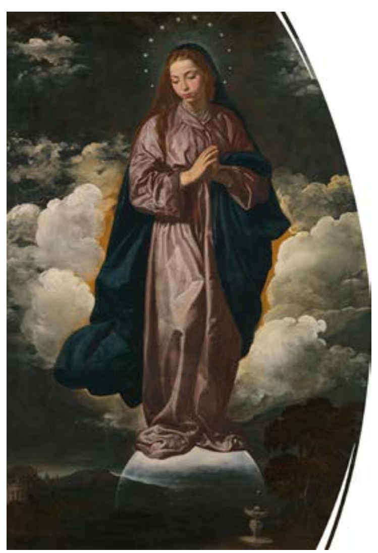
The Immaculate Conception by Diego Velazquez

Advent I Sunday, December 1, 2024 9:15 a.m. (pages 2-6) 11:00 a.m. (pages 7-10)