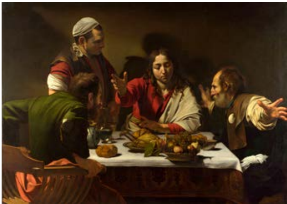
The Supper at Emmaus by Caravaggio